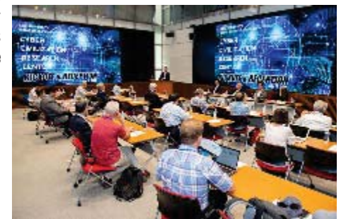
CCRC kickoff event