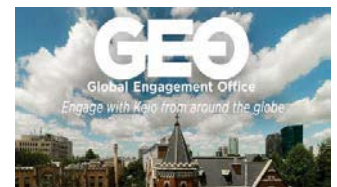
Global Engagement Office website

In April, the Office for Equity, Diversity, and Inclusion was established with the aim of developing a campus environment that recognizes diversity. In November, the Global Engagement Office (GEO) was established to expand IR and international public relations activities.